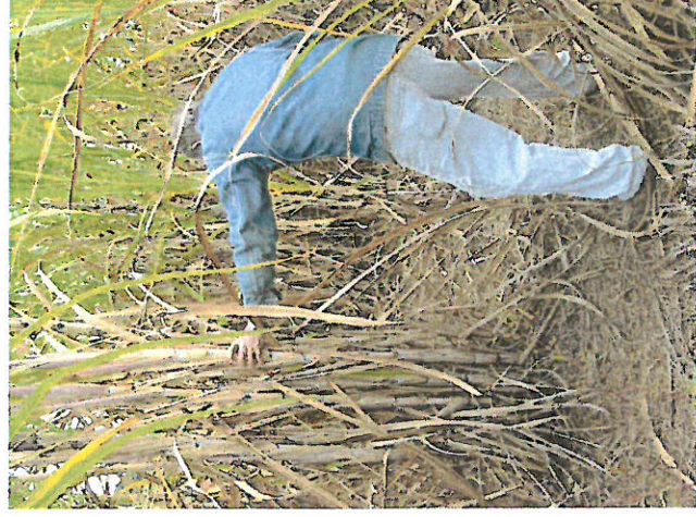
Cane Cutting at Field Day