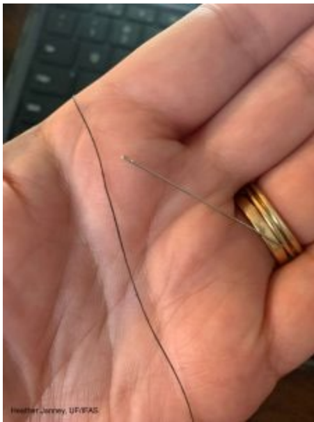
Drape the thread across your palm

Now, a threader might be awesome to some but if you are visually impaired, it can still be a nightmare. I recently learned another way to thread a needle while scouring the web. People swear it works but it takes a good bit of practice. First, cut your piece of thread like the other two ways we've discussed. Next, you'll drape the thread across your palm with the ends hanging off your palm and just below your pointer finger. After that, pick up your needle and lie it across the thread so that the eye of the needle is facing up. Next, you'll begin moving the needle across the thread and it eventually will bunch up through the eye of the needle. And the thread pulls through...the needle is threaded! No supreme or okay vision skills needed except to see if the eye of the needle is facing the correct direction!