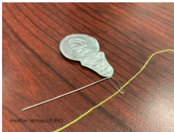
A needle threader

Have you seen all of those pictures floating around on social media with, "if you know what this is, share"? Yes, this falls into that category. A needle threader. Its included in most sewing kits and even sometimes in those little bitty kits that include the necessities for patching or repairing a button. It looks like a strange coin that someone over flattened and reprinted Abraham Lincoln's head on it. Yeah, I have no clue as to why manufacturing companies have always insisted on some guy's head being imprinted on the portion of it that you hold. However, it can truly be your best friend when threading a needle! Do the same as you would with cutting a piece of thread but this time, you'll start by pushing the little metal loop of the threader through the eye of the needle. Next, insert the thread through the loop and pull the needle threader back out of the eye of the needle. Your thread will come with it and viola! Your needle is threaded! Simple!