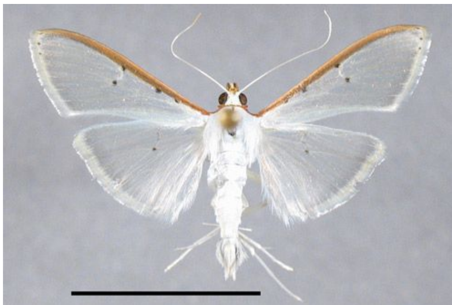
Figure 1. Palpita persimilis Munroe, adult habitus. Scale = 1 cm.

Palpita Hübner includes several dozen tropical and temperate species globally, most of which feed on Oleaceae if the host is known. Palpita vitrealis (Rossi), better known by the synonym Palpita unionalis (Hübner), is a major pest of olive and jasmine in Europe and Asia (Yilmaz and Genç 2012). Palpita nigropunctalis (Bremer) in East Asia feeds on several oleaceous species, including ligustrum and lilac (Gotoh et al. 2011). The larvae commonly construct untidy webs of leaves and silk in which they consume the leaves and, in some species, also the fruit.