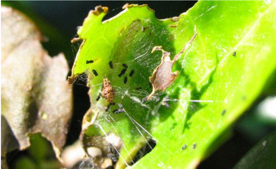
Figure 9. Leaves tied together with larva inside.