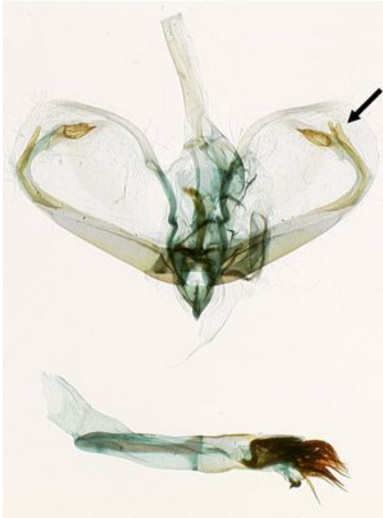
Figure 4. Male genitalia. Elongate processes of right valve indicated.

Female genitalia: In Palpita persimilis ( Figure 5A ), the lamella postvaginalis is slightly asymmetrical with respect to a spout-like mediobasal depression. The lamella is flat, rounded and symmetrical in the other white species in Florida ( Figure 5B, C ).