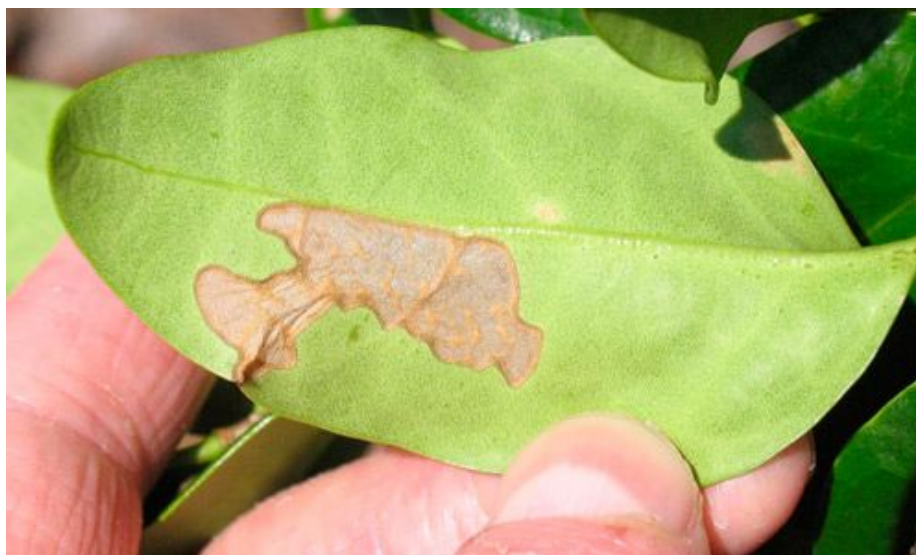
Figure 8. Feeding damage to epidermis of leaf.

The main hosts of the olive shootworm are Ligustrum japonicum Thunb. (Japanese privet) in Florida and elsewhere, and Olea europaea L. (olive) in southern and western South America (Wille 1952, Chiaradia and Da Croce 2008). The first record of it on olive in Florida was in 2014. Larvae have also been found feeding on Madagascar olive, Noronhia emarginata (LAM.), in Florida. All of these host plants are in the family Oleaceae.