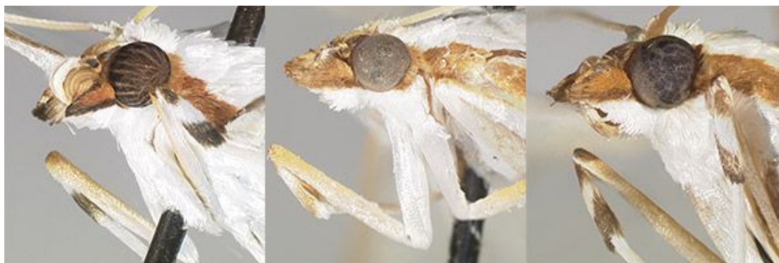
Figure 3. Labial palpi and foreleg tibia: A. Palpita persimilis ; B. Palpita kimballi ; C. Palpita quadristigmalis .

on the palpi and forelegs, although more brown or gray and not quite as distinct, but the average size is larger (26-30 mm in FSCA specimens). The forewings also have a slightly yellowish tinge, although assessment requires direct comparison of the different species under good, consistent lighting. However, specimens of Palpita persimilis from the earliest interception (Broward Co.) are large and slightly yellow, like Palpita quadristigmalis , so definite identification requires genitalic dissection.