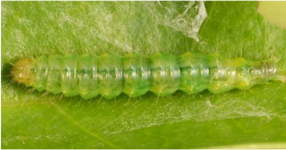
Figure 6. Live larva, about 2 cm long.

not otherwise colored, a distinct brown spot is obvious on the subdorsal pinaculum of the second thoracic segment ( Figure 7A ). This last character also occurs in other Palpita species that feed on Oleaceae (Allyson 1984) as well as a few other crambid moths, such as the Bougainvillea caterpillar ( Asciodes gordialis [Guenée]) and some specimens of the Mulberry leaf-tier ( Glyphodes sibillalis Walker). The spot is obscured when other pinacula are colored ( Figure 7B ).