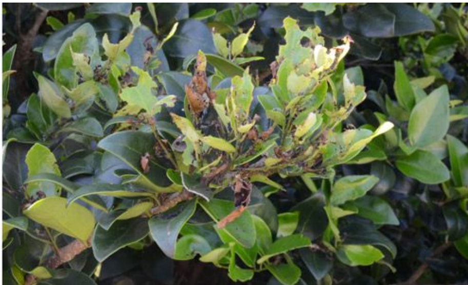
Figure 10. Defoliation of new growth. Photograph by Lyle J. Buss .