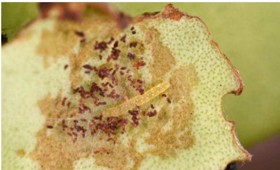
Figure 11. Young larva, about 2 mm long.

Control measures are difficult because of the habit of concealed feeding. Several natural enemies have been tested with varying success (Chiaradia and Da Croce 2008). Trimming foliage to remove eggs and nests, if applied, should be done thoroughly, because any surviving larvae will prefer to consume the resulting new growth..