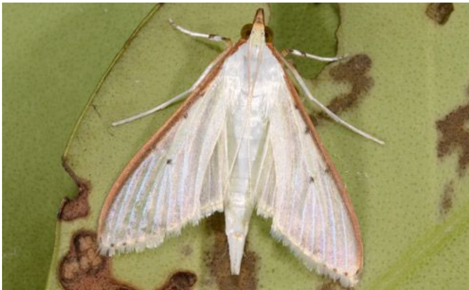
Figure 2. Palpita persimilis Munroe, live adult.

2012. The homeowner indicated that other infestations were unreported in the area. More specimens were subsequently found in the Florida State Collection of Arthropods (FSCA), the earliest of which were raised on privet in January 1980 at the Fort Lauderdale IFAS Agricultural Research Center. Vouchered adults from 1992 (Valrico, FL) and 1999 (St. Cloud, FL) were raised from larvae feeding on privet in nurseries. Several lots of Palpita larvae that may represent the same species have been collected on privet since the early 1980s.