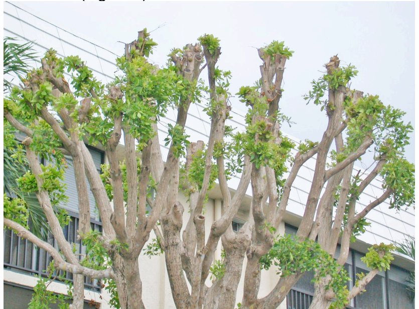
Figure 3. This, “black olive” tree, Bucida buceras , was topped (hat-racked) in Naples, Fl.