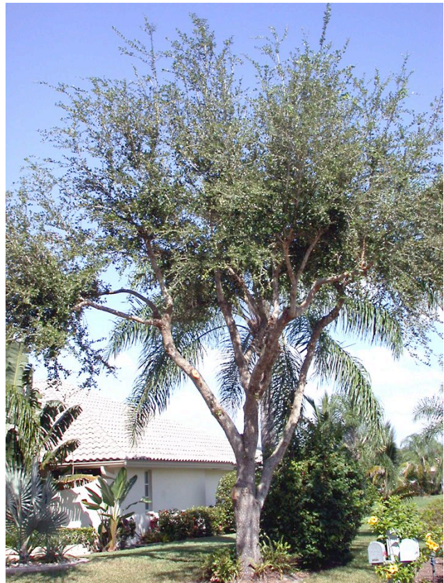
Figure 5. This oak tree was gutted (lion's-tailed), that is, smaller branches were stripped from main branches and over-lifted, that is, too many bottom branches were removed. This makes the tree top-heavy and more prone to storm damage as all of the weight is shifted to the ends of the main branches.

Start with, "Tree Pruning for Hurricanes." https://www.youtube.com/watch?v=Ht-U1f9K7zo