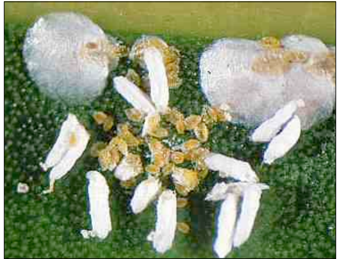
Adult female scales are disk-shaped, while the male scales are elongate. The first instars (called "crawlers") are the little amber colored individuals in the center of the picture.

onion) as well as on roots. CAS populations also accumulate under the thick layer of woolly material near the frond bases on the trunk. This pest has repeating, overlapping generations. This means a constant re-invasion every 4 to 6 weeks especially during March through October in south Florida. Plus, each female scale can produce about 100 eggs, which makes their management even more challenging. The white appearance of plants is primarily due to the males which outnumber the females 10,000 to one!