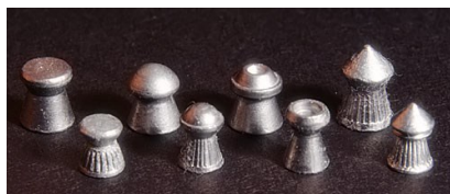
From left to right: flat nose or wadcutter, round nose or domed, hollow point and pointed pellets. Top row .22 caliber (5.5 mm), bottom .177 (4.5 mm) caliber.

piston, pneumatic, and CO 2 . Pneumatic air guns utilize pre-compressed air as the source of energy to propel the projectile. Pneumatic air guns can be single-pump, multi-pump, or pre-charged.