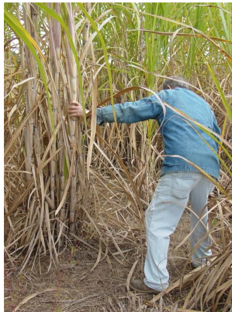
Cane Cutting at Field Day