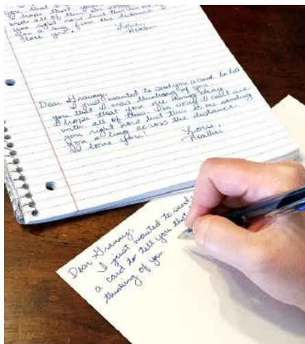
Handwrite a message inside of your card but be sure to practice first.