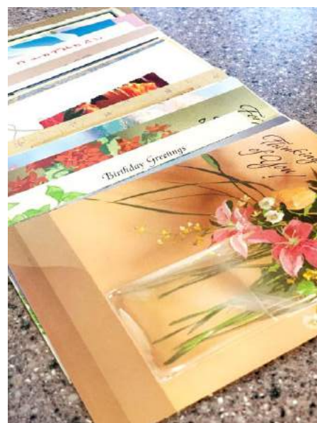
Many people keep a stack of blank multi-occasion cards for those last-minute needs.

If you are choosing a card at the store, look for the highest quality card and envelope. Your special attention to detail will be noticed by the recipient and will make the experience more memorable. However, the option of going to a store is not always available. You can go through the cards you might have sitting around at home and find the best ones for the best people. Try to send the right card for the right occasion. Another thing to remember is to not send a crumpled card or envelope. You want what you are mailing to look as nice as possible.