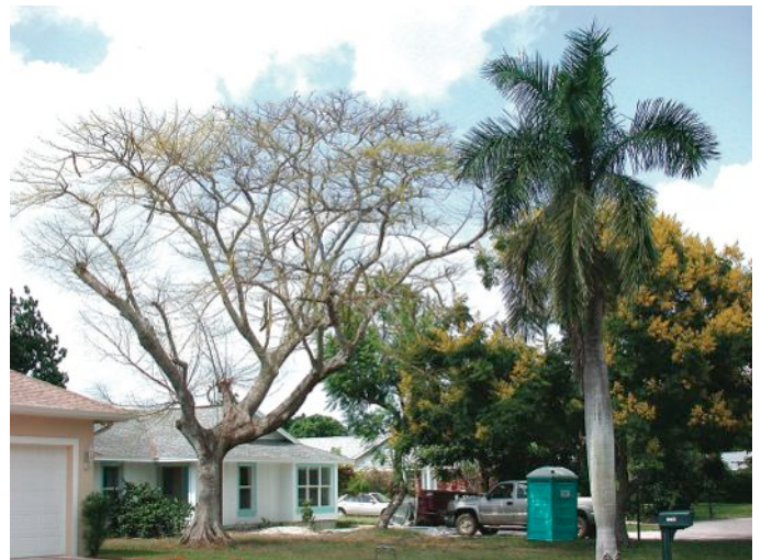
Fig. 1. Melipotis acontioides caterpillars defoliated this 35- to 40-ft royal poinciana tree in Naples, FL. Picture was taken on 28 Sept. 2006. In 2006 there were at least four 30- to 40-ft royal poincianas that were 50% to 100% defoliated by 10 Oct.

DESCRIPTION. The full-grown caterpillar is 1-5/8 inches long with highly variable markings, mottled, lateral black-brown longitudinal stripes with a brownish pink, mid-dorsal stripe that bears four to five diamond-shaped spots (Fig. 3). The moth's front wings are typical for a cutworm—dingy brown-gray with scattered dark brown shadings and dark brown zigzag markings at the wing tips. The most unique characteristic is the color pattern