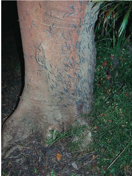
Fig. 2. The “river of caterpillars” streams up a royal poinciana trunk. Melipotis acontioides is a night-feeder and races up the tree trunk shortly after sunset in great numbers as if a dinner bell had sounded.