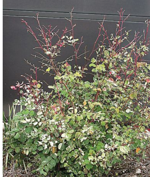
Fig. 4. Snowbush caterpillars start feeding at the top of the shrubs and work their way down—even stripping the bark off when the foliage is gone.

Should one have an outbreak of this caterpillar, there would be no need to spray an insecticide into the upper canopy due to a weak link in the caterpillar’s behavior—the nightly ascending