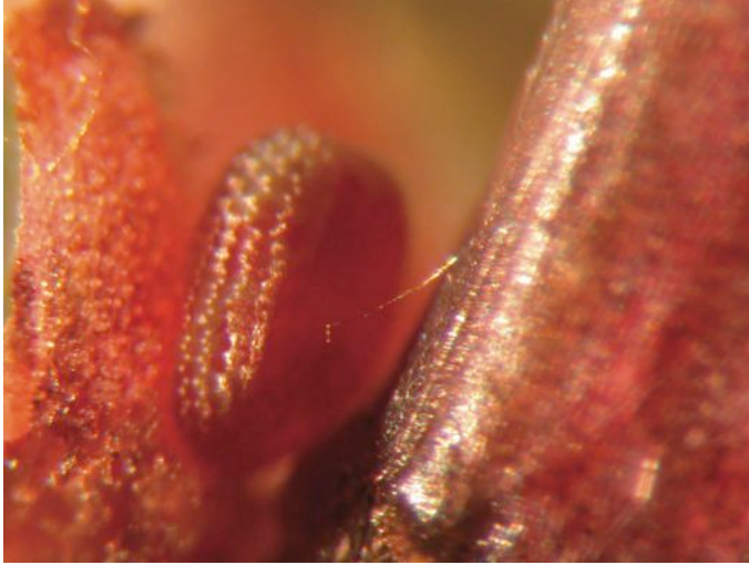
Fig. 5. An egg of the white-tipped black moth, Melanchroia chephise , is deposited at the base of a petiole near the main stem. Eggs are about 0.7 mm long, salmon colored, and with a pebbled surface.