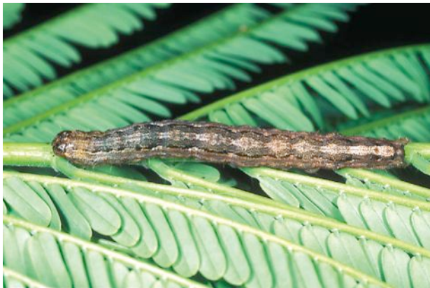
Fig. 3. The full-grown royal poinciana caterpillar is about 1-5/8 inches long.

of the hind wings. Each hind wing is mostly white with a brown blotch toward the edge. The wingspread is about 1-1/2 inches.