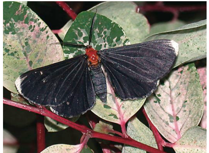
Fig. 7. The wings of the snowbush moth are a velvety, navy-blue-black with white margined tips plus an orange thorax. The wingspread is a little over 1 inch. It is sometimes referred to as the white-tipped black moth.

Management suggestions include pruning the new growth when the chewing has started, as the larvae do not seem to climb back readily. A pesticide containing Bacillus thuringiensis ( B.t. ) or a horticultural soap or a pyrethroid may be needed if repeated attacks occur. Considering that the plants are not too expensive, they may be easily replaced. More information is needed on predators and parasites and egg production of the females.