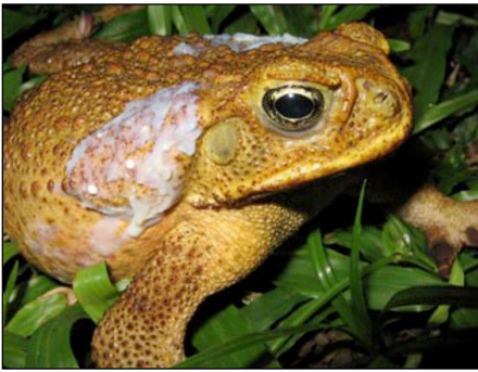
Toxin being released from the parotoid glands of the Cane Toad.

inches in length. The southern toad also has smaller parotoid glands and two short, parallel ridges that start as knobs between the eyes and extend down the back for an inch or so. The cane toad has no knobs or ridges between the eyes. The cane toad has dry, warty skin and the color is usually various shades of brown with some grey, some are yellow, red-brown or olive brown with varying brown and white mottling.