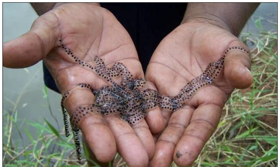
A female deposits batches of 8,000 to 25,000 eggs and the gelatinous egg strings can stretch up to 66 feet in length. Beware! they are poisonous.

If your dog exhibits these symptoms it is crucial to immediately remove the toxins from its mouth (not into its stomach). Take a wash cloth and try to clean the gums and mouth as you rinse the poison away. Mixing hydrogen peroxide with water 50:50 on a wash cloth wash may help deactivate the toxin. Then get to the veterinarian ASAP. If the toad was swallowed, it must be removed, either surgically or with an endoscope. Fido's temperature should be monitored because