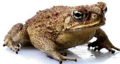
Cane Toad, Rhinella marina [Formerly Bufo marinus ] AKA "Bufo Toad", Marine Toad or Giant Toad