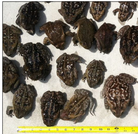
Partial catch from June 2014 neighborhood Cane Toad hunt—37 Toads collected in one hour on a one mile hike.

For updates on the Southwest Florida horticulture visit: http://collier.ifas.ufl.edu