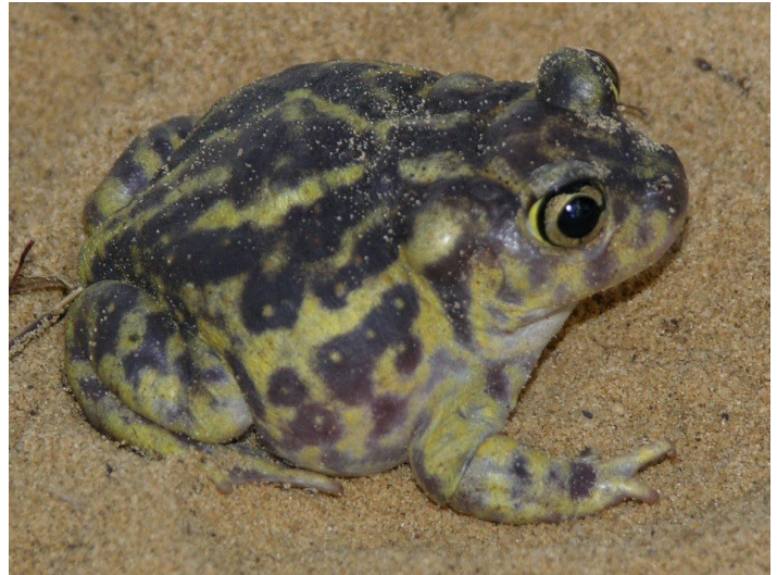
Figure 6. Native eastern spadefoots are usually less than 2 inches long and may have numerous yellow markings.