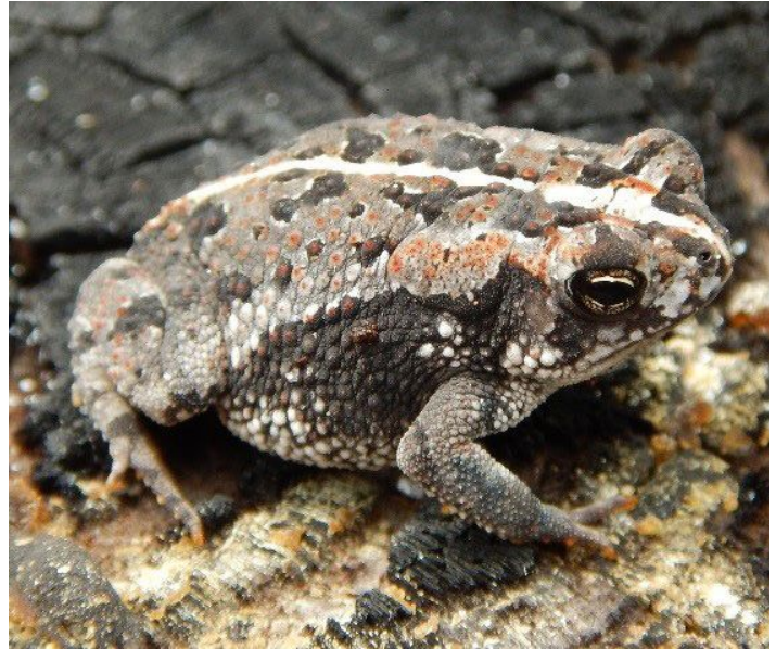
Figure 5. Native oak toads are little and have small, oval glands on their shoulders. Paired crests on top of their heads are indistinct.