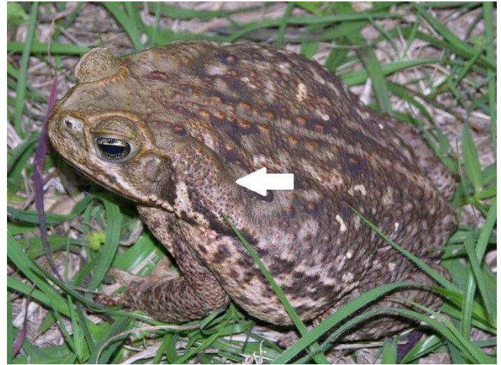
Figure 2. Invasive cane toads have very large poison glands on their shoulders (indicated with arrow)—these glands are somewhat triangular, usually tapering back to a point. They also have a ridge around their eyes and over their nose.

Adult cane toads measure between three and six inches long, and some individuals reach eight or nine inches. Males and females can be distinguished by differences in coloration and the texture of their back skin; females have smooth, mottled, brown and white backs, whereas the