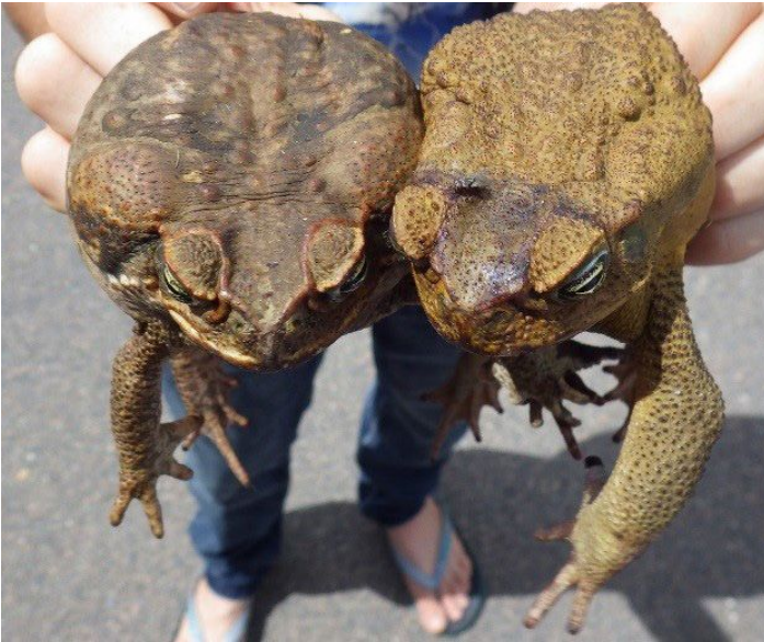
Figure 3. Cane toad female on left and male on right. Note differences in skin color and texture.