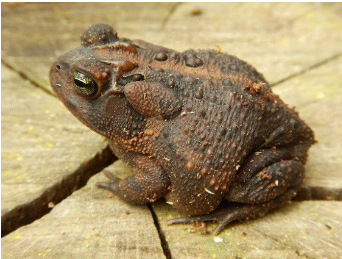
Figure 4. Native southern toads have small, oval glands on their shoulders and a pair of raised ridges or crests on top of their heads.